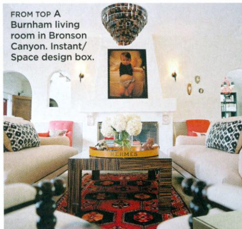
FROM TOP A Burnham living room in Bronson Canyon. Instant/ Space design box.