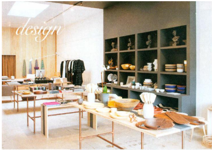
FROM TOP Garde, L.A. Tom Dixon form dish sets, $90-$130. Hudson Grace, S.F.